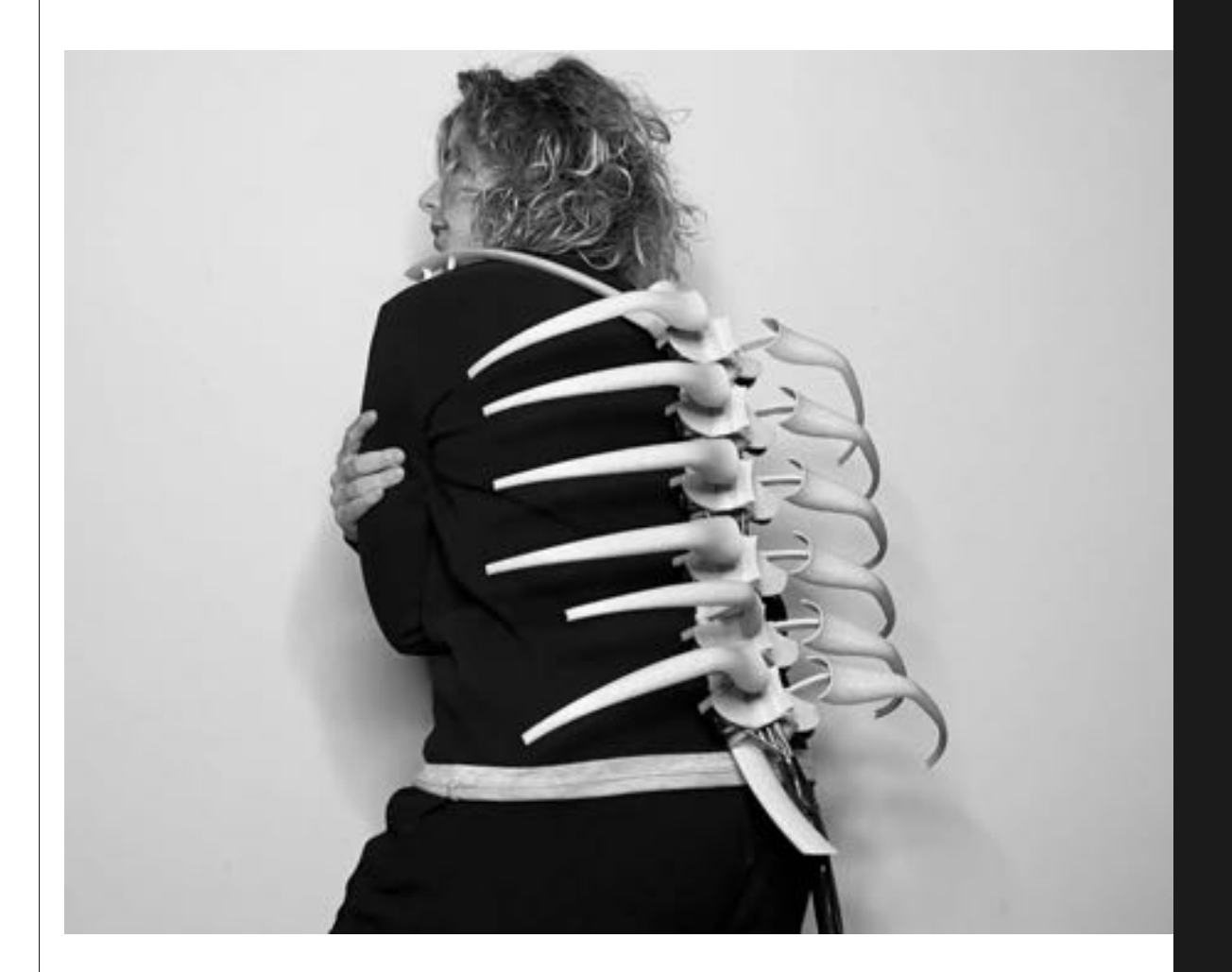
Eoskeleton by Chen Zhuo, 2021, robotic wearable device.

You founded the 4D Design department at Cranbrook, is this current generation of AI consistent with your vision